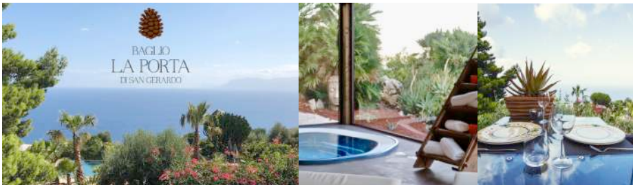
Baglio La Porta – Zingaro Reserve - San Vito Lo Capo (TP) – www.bagliolaporta.it