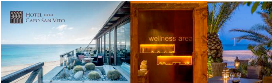
Hotel Capo San Vito – San Vito Lo Capo (TP) – www.caposanvito.it

Small Luxury Collection Geocharme, in addition to the villa in which you are and that you have around, has the following hotels near Castelvetrano: